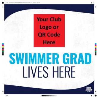
Swimmer Grad Lives Here Yard Sign | Instructions

Be sure to explore all of the items in the Marketing Toolkit and tag @usaswimmingnextgen on social media to show us how you're using these items and for a chance to be featured on our channels.