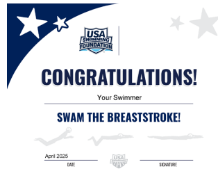
Breaststroke Specific Certificate | Instructions