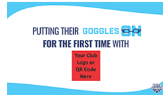
Goggles On Interactive Poster | Instructions